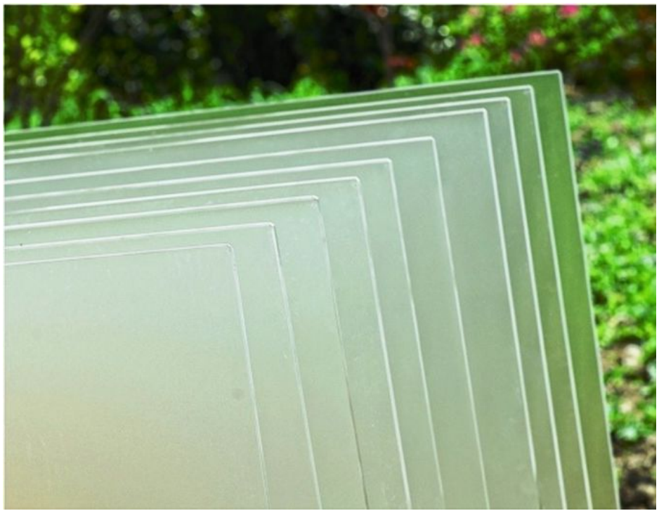
Packaging & Shipping