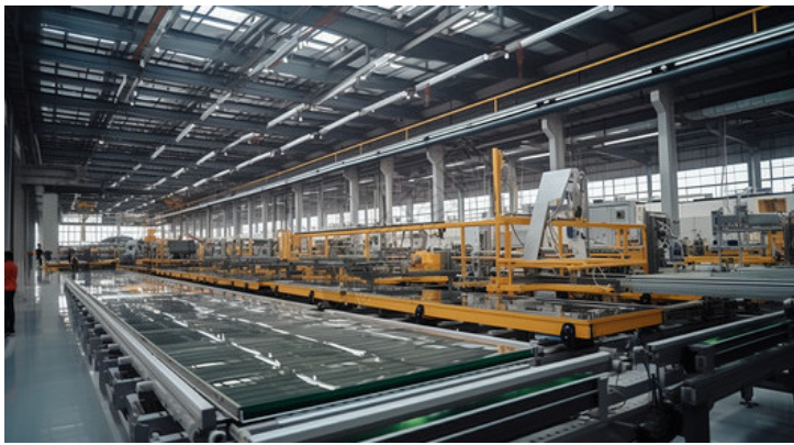
Packaging & Shipping

Laminated Tempered Glass 6.38/10.38/16/12 /13.52 mm Low Iron Polished Edge Tempered Laminated Glass