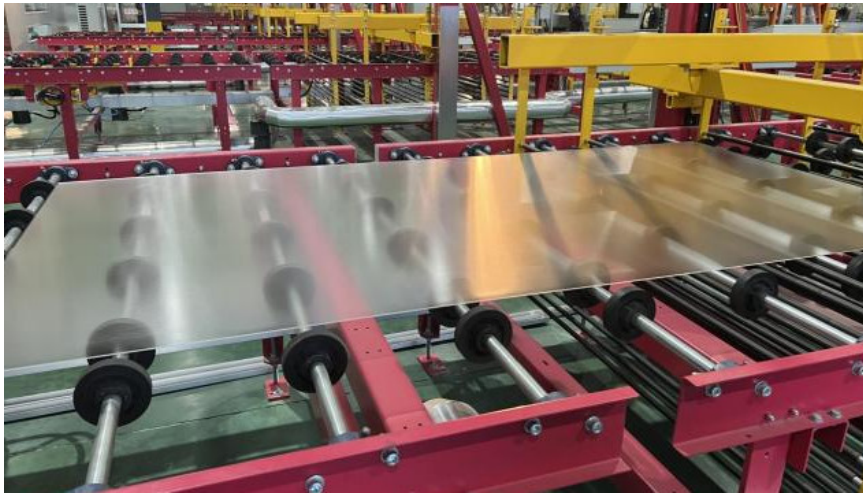
Packaging & Shipping

Laminated Tempered Glass 6.38/10.38/16/12 /13.52 mm Low Iron Polished Edge Tempered Laminated Glass